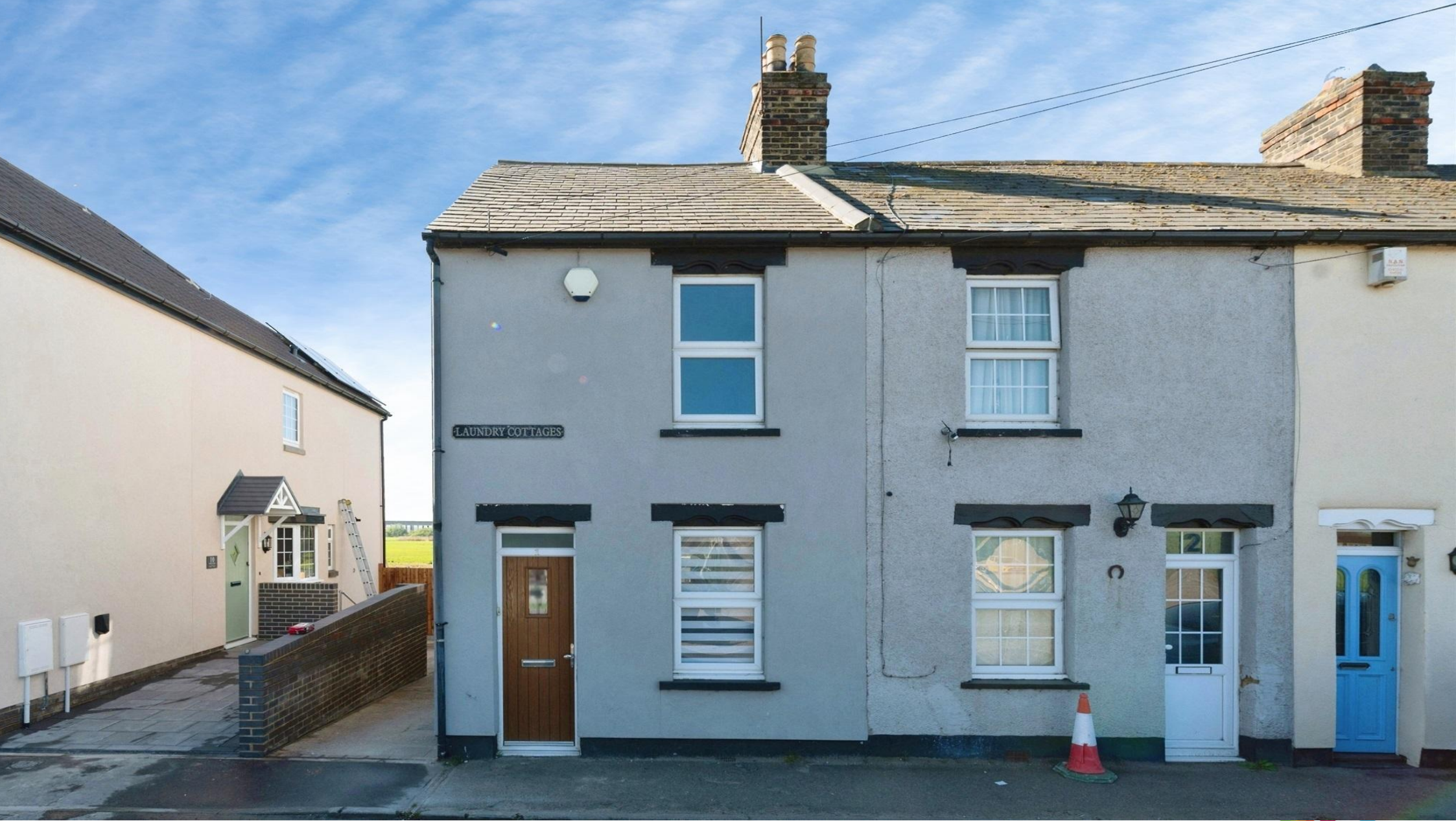
Laundry Cottages, Wennington Road, Wennington, Rainham RM13 9DW