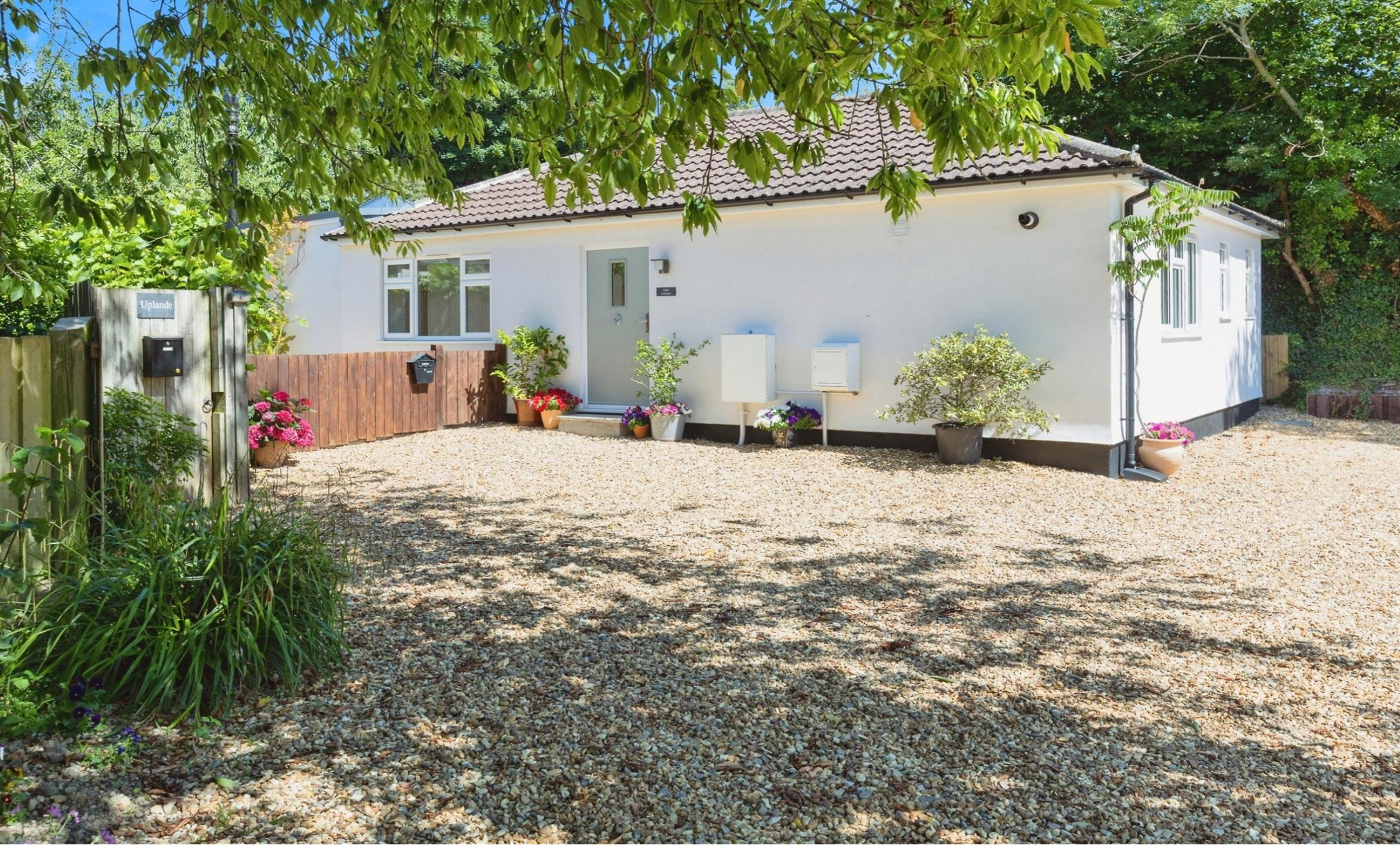
Little Orchard Fossway, Dunkerton Bath BA2 8BR