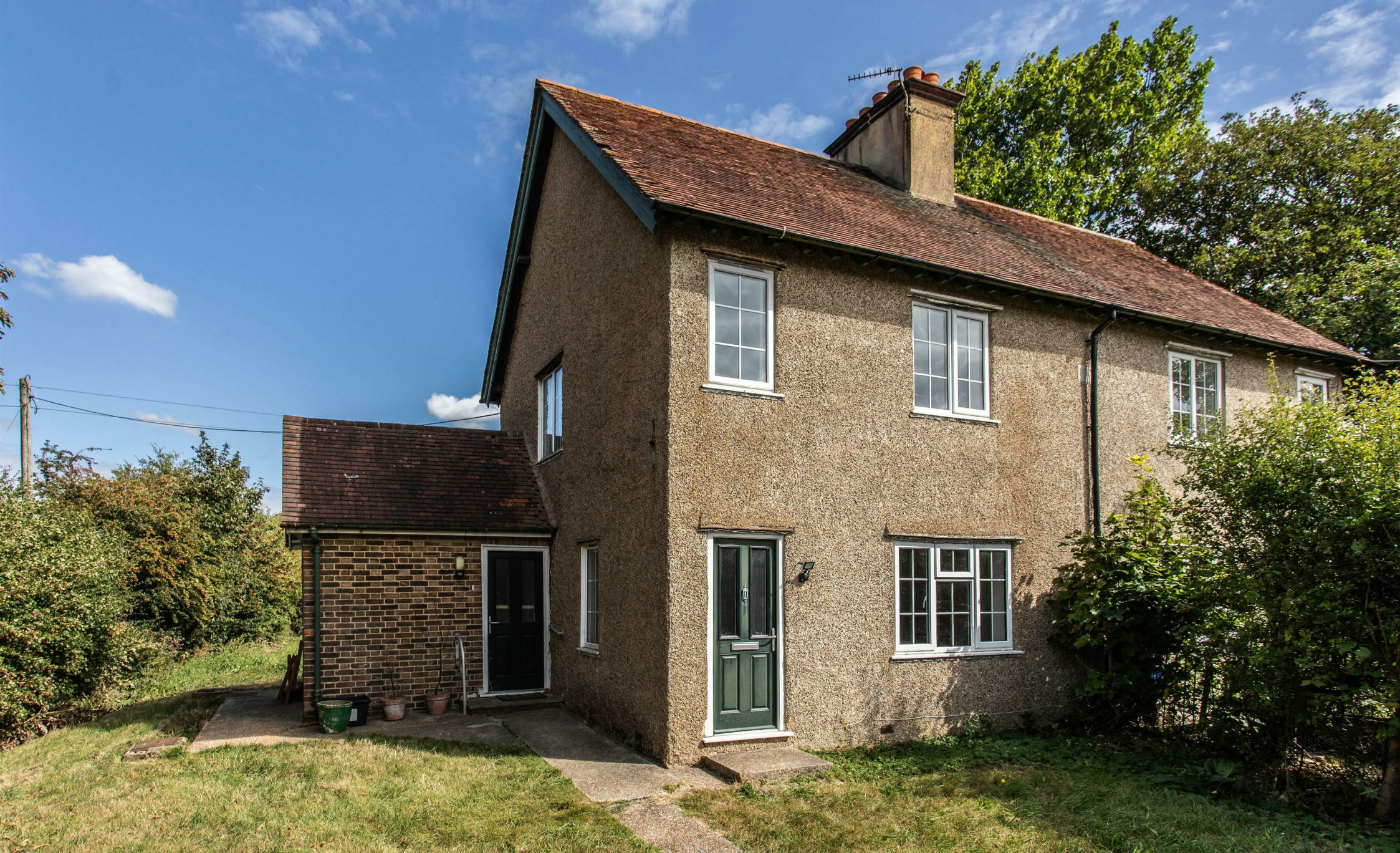
1 New House Cottages, Beddingham, Lewes, East Sussex, BN8 6JX