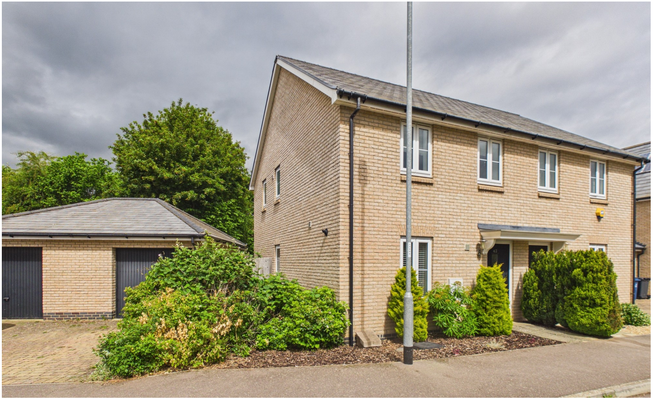
Racecourse View, Cottenham CB24 8AP