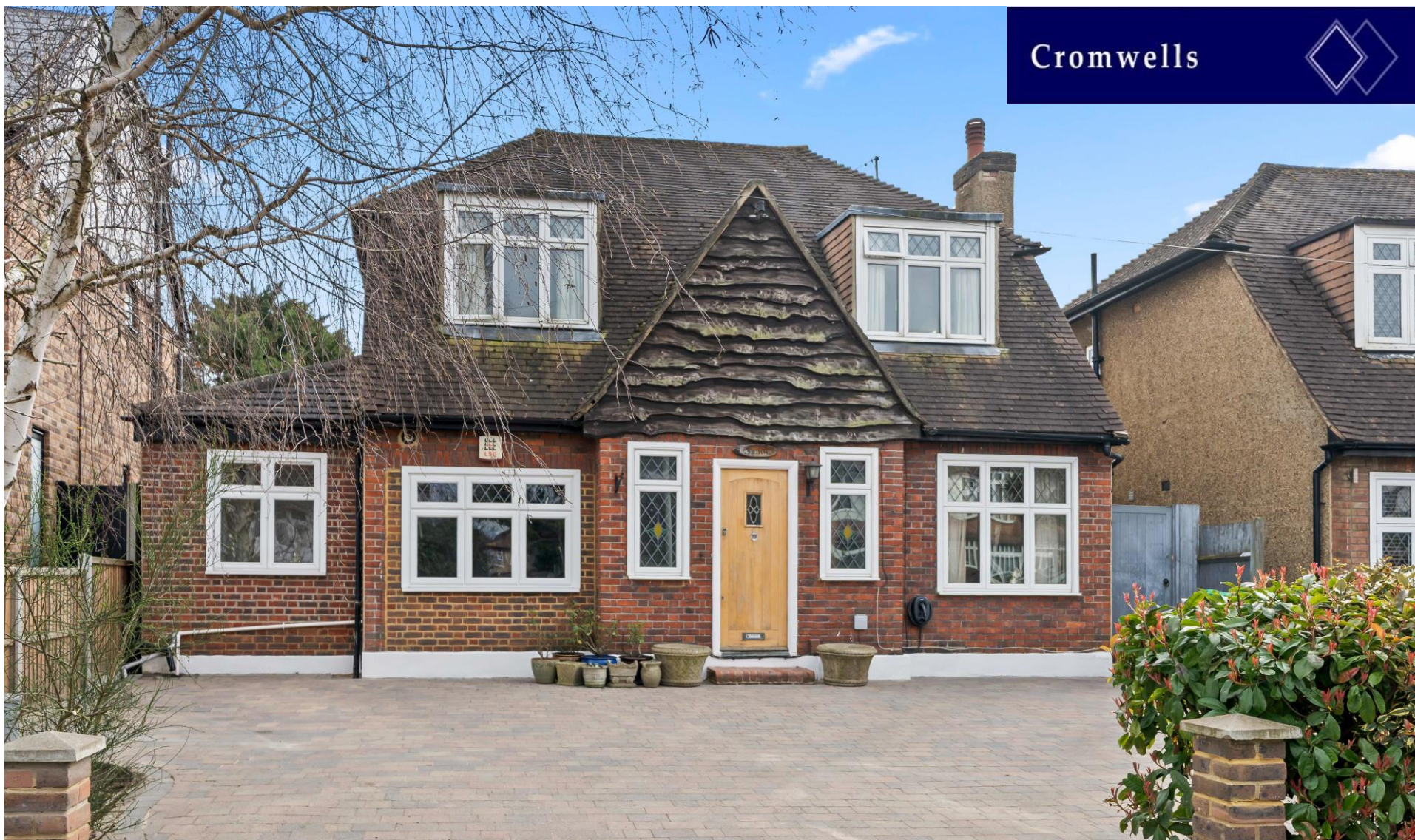
Jontia, 29 Church Road, Worcester Park, Surrey, KT4 7RJ Guide Price £875,000