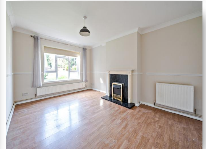
2 Sussex Lodge, Courtlands, Maidenhead SL6 2PS