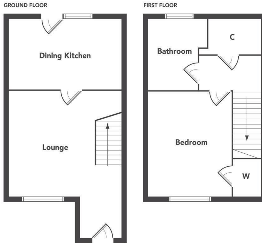
Floorplans are indicative only - not to scale Produced by Plush Plans Ltd