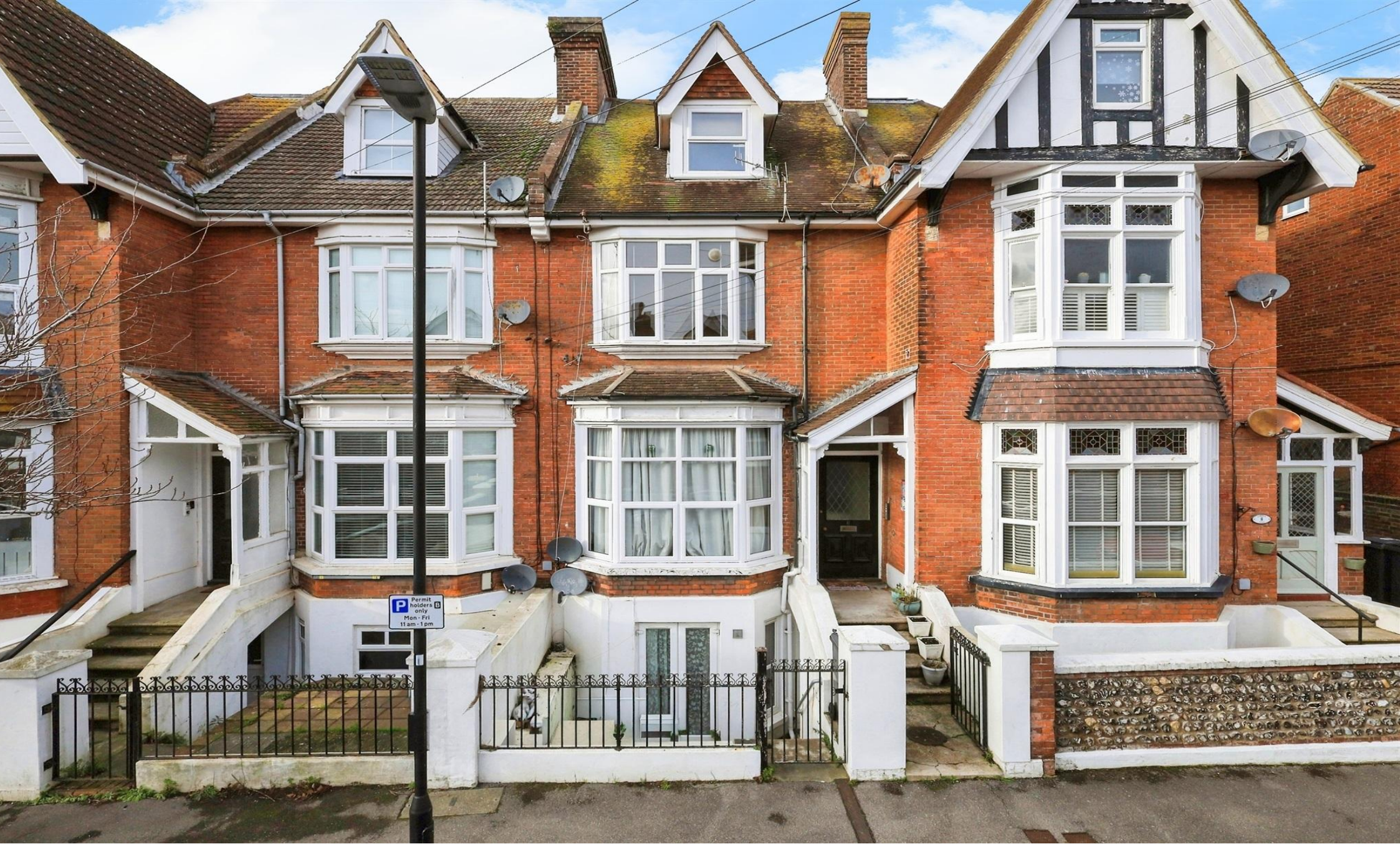
Bedford Grove, Eastbourne BN21 2DT