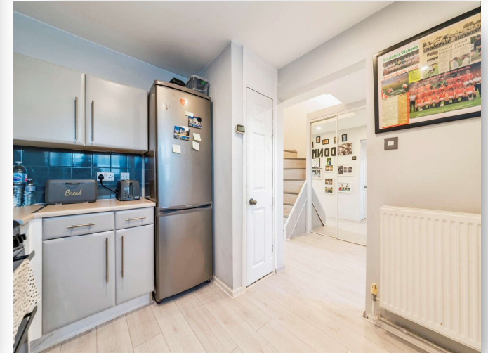
Chatham Court, Newark NG24 4BH