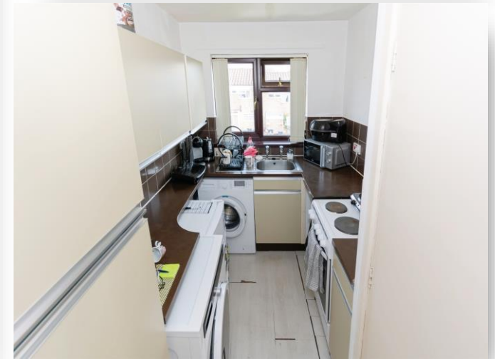
Boar Hound Close, Birmingham B18 7LQ