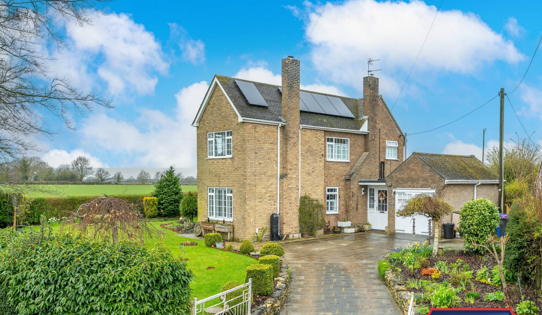
The Beeches Wickenby Road, Lissington, Lincoln. LN3 5AE