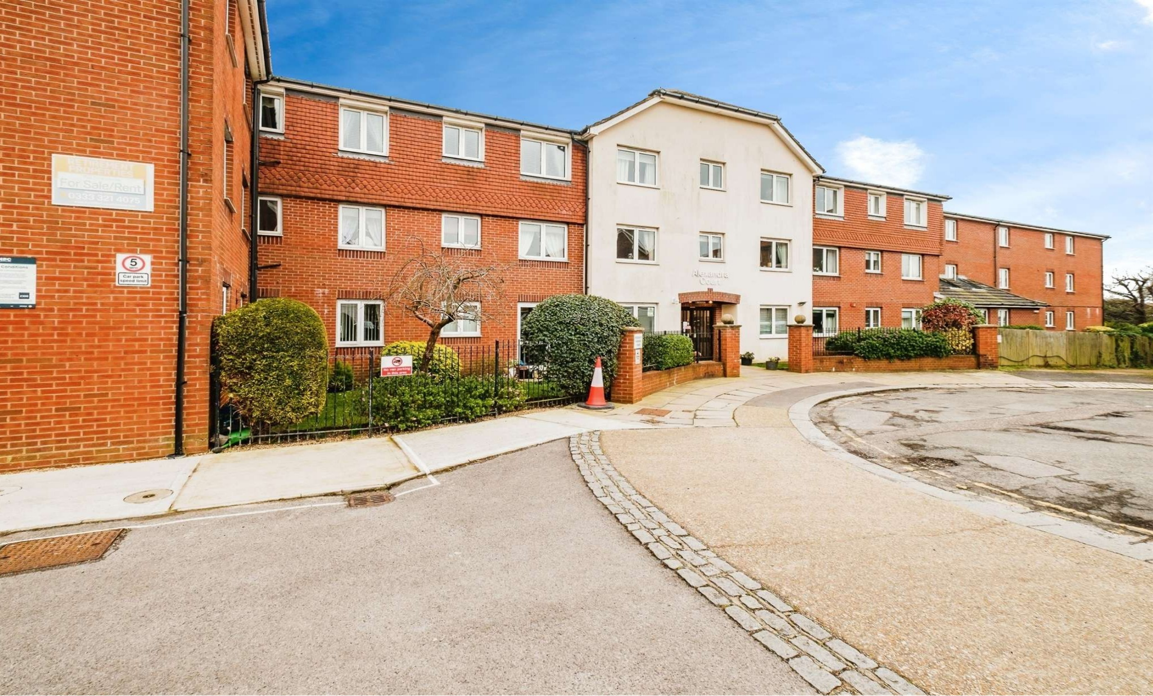
Alexandra Court St Peters Close, Hove BN3 7RF