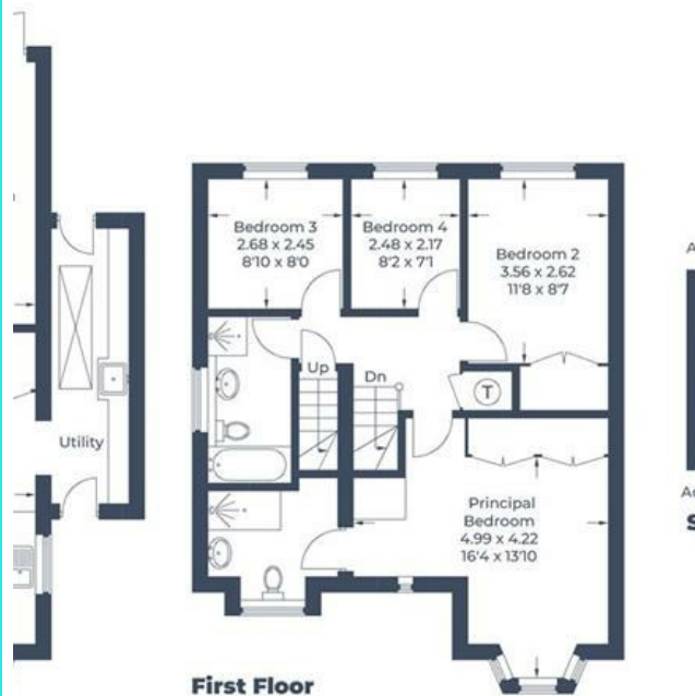
Illustration for identification purposes only, measurements are approximate, not to scale. © CJ Property Marketing Produced for Fine Homes Property

Approximate Gross Internal Area Ground Floor = 80.7 sq m / 869 sq ft First Floor = 63.8 sq m / 687 sq ft Second Floor = 27.3 sq m / 294 sq ft Garage = 12.9 sq m / 139 sq ft Total = 184.7 sq m / 1,989 sq ft