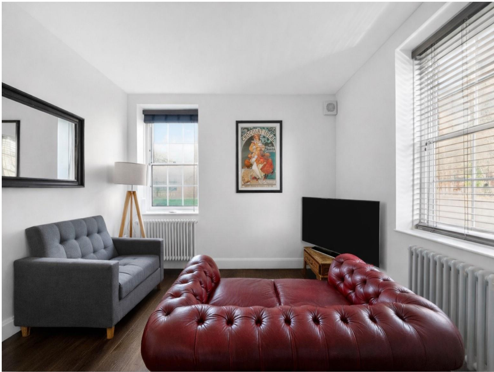
William Bonney Estate, London SW4 7JG