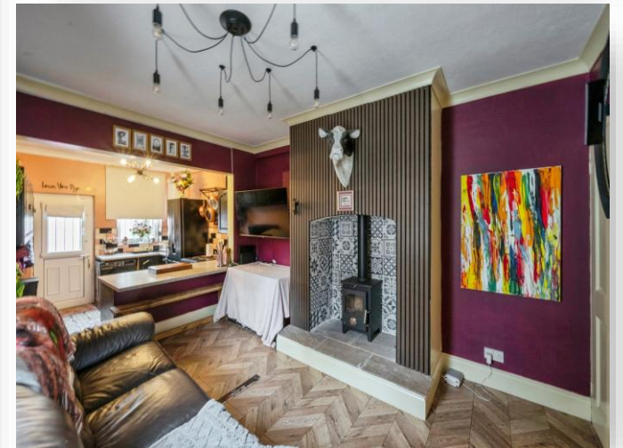
Highgate Lane, Goldthorpe Rotherham S63 9BH