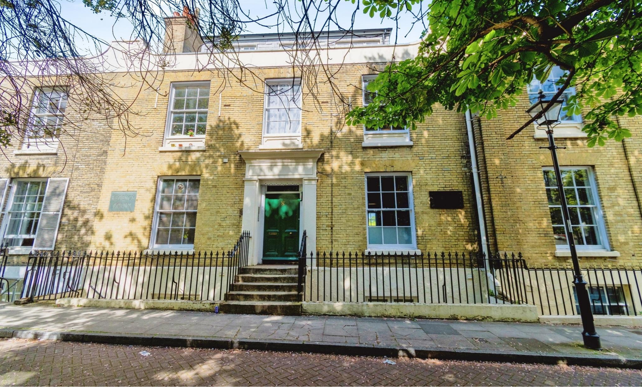
Regency Court, Cranbury Terrace, Southampton SO14 0LH