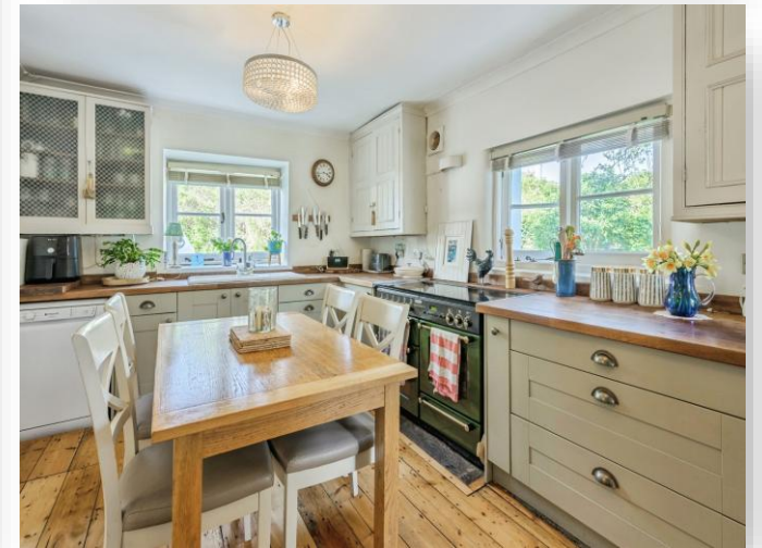
Battershill House Arcadia Road, Elburton PL9 8EG