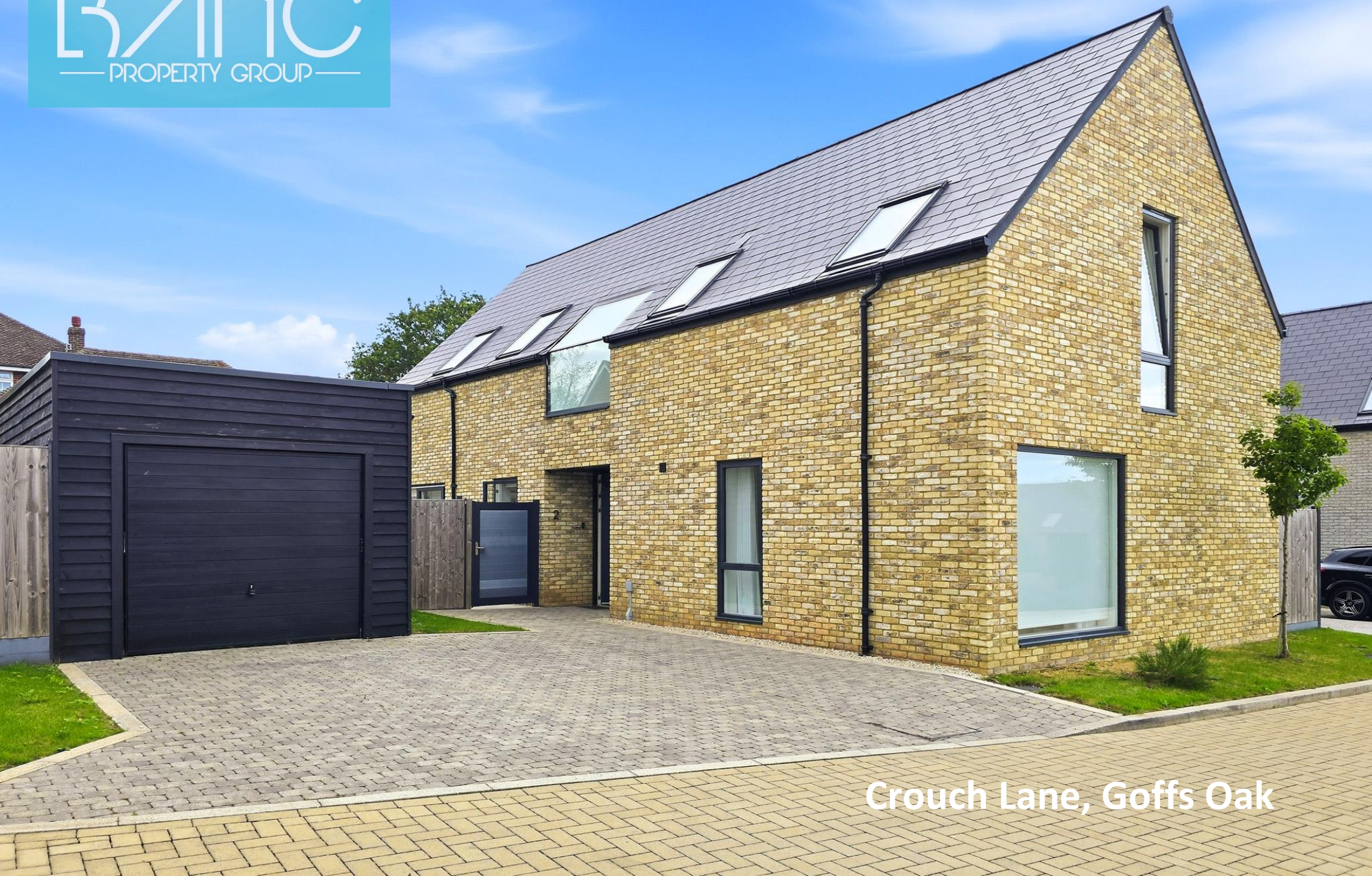
Crouch Lane, Goffs Oak