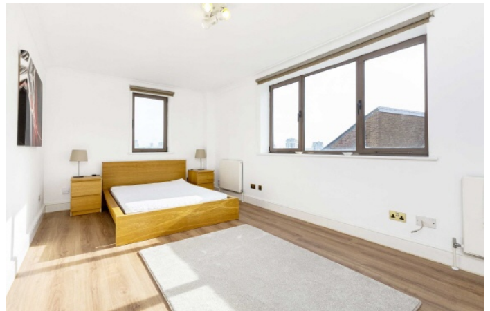
Cumberland Mills Square, E14