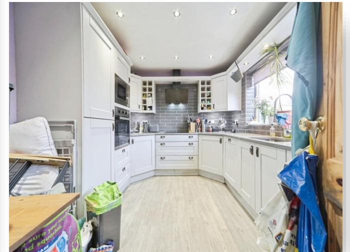
Fairbank, Shipley BD18 2EW