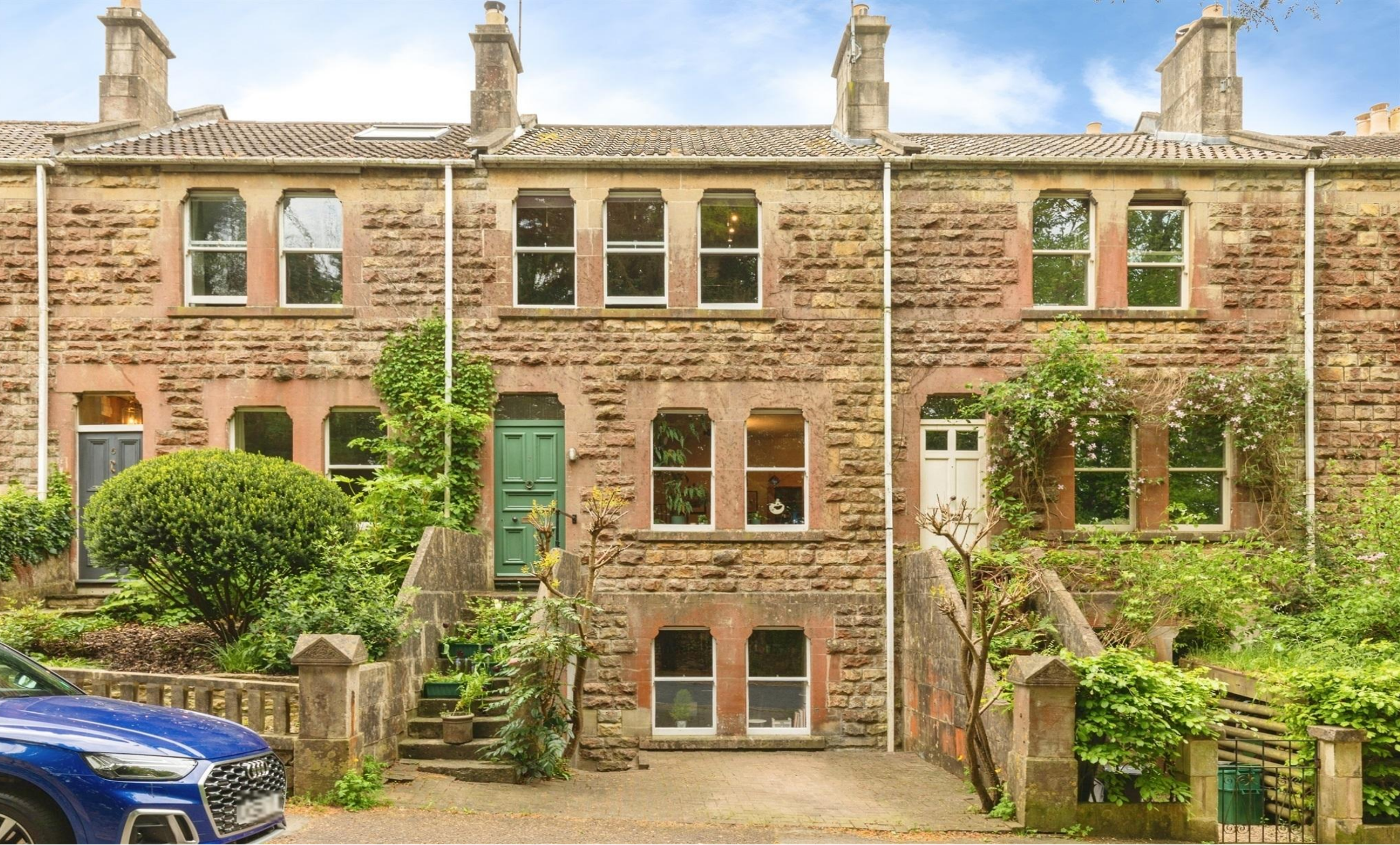
Clarence Terrace, Bath BA2 6EB