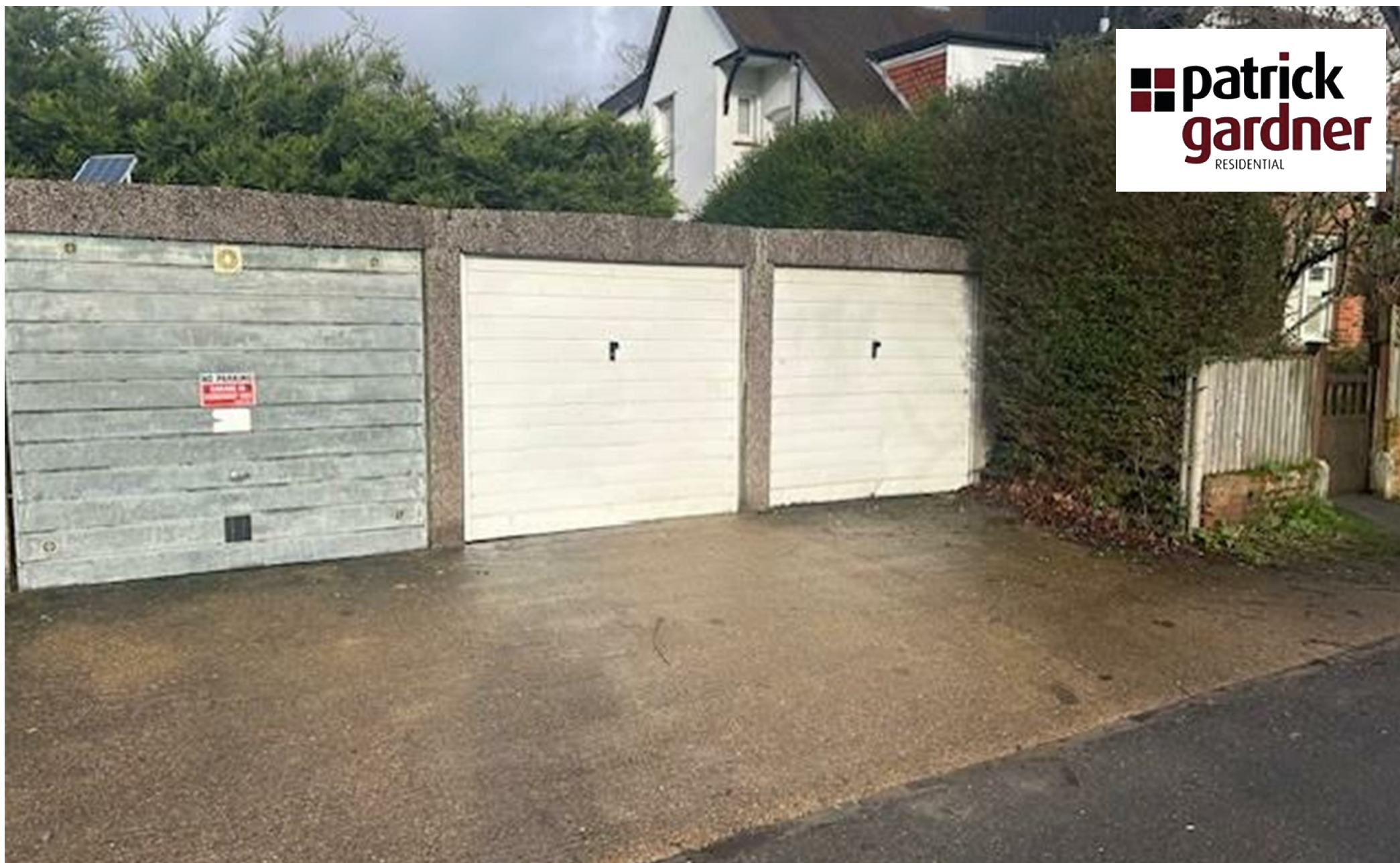
Garage, Woodvill Road, Leartherhead, KT22 7BP