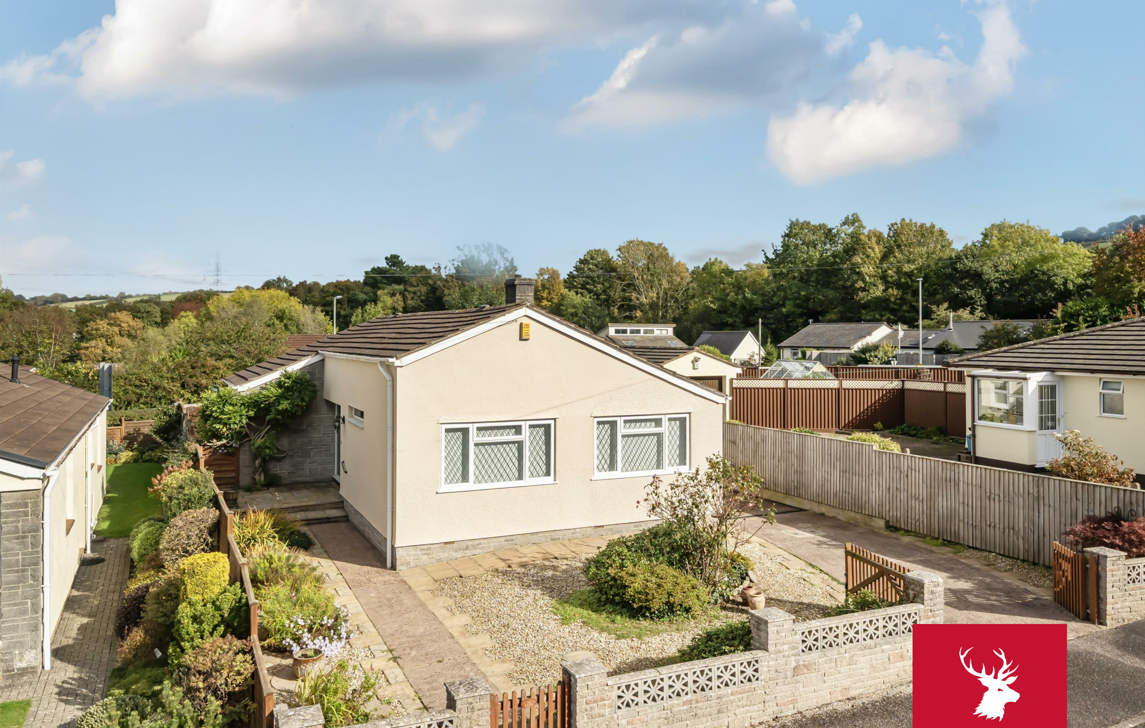
12 The Chase