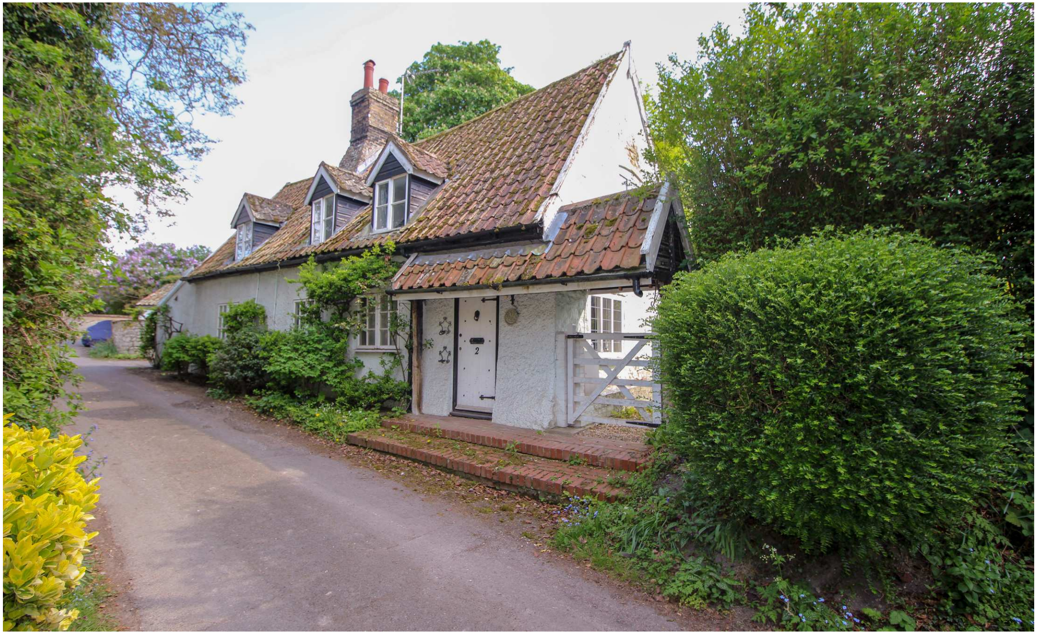
Gardeners Cottage, Burwell