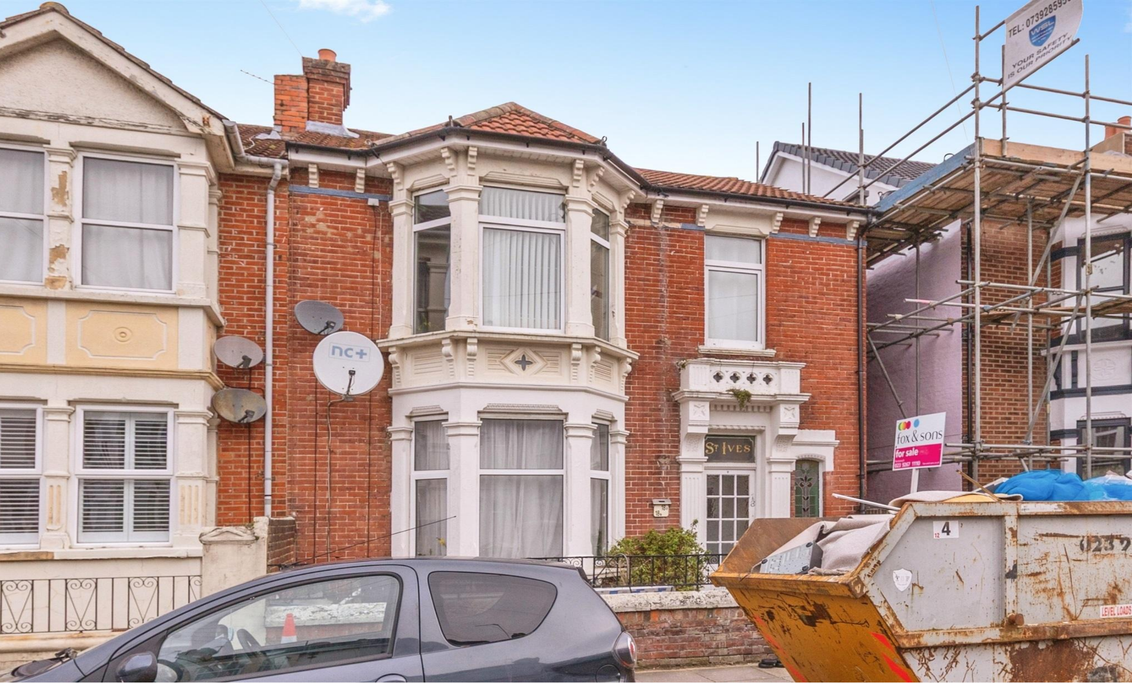
Upper Flat North End Avenue, Portsmouth PO2 9EB