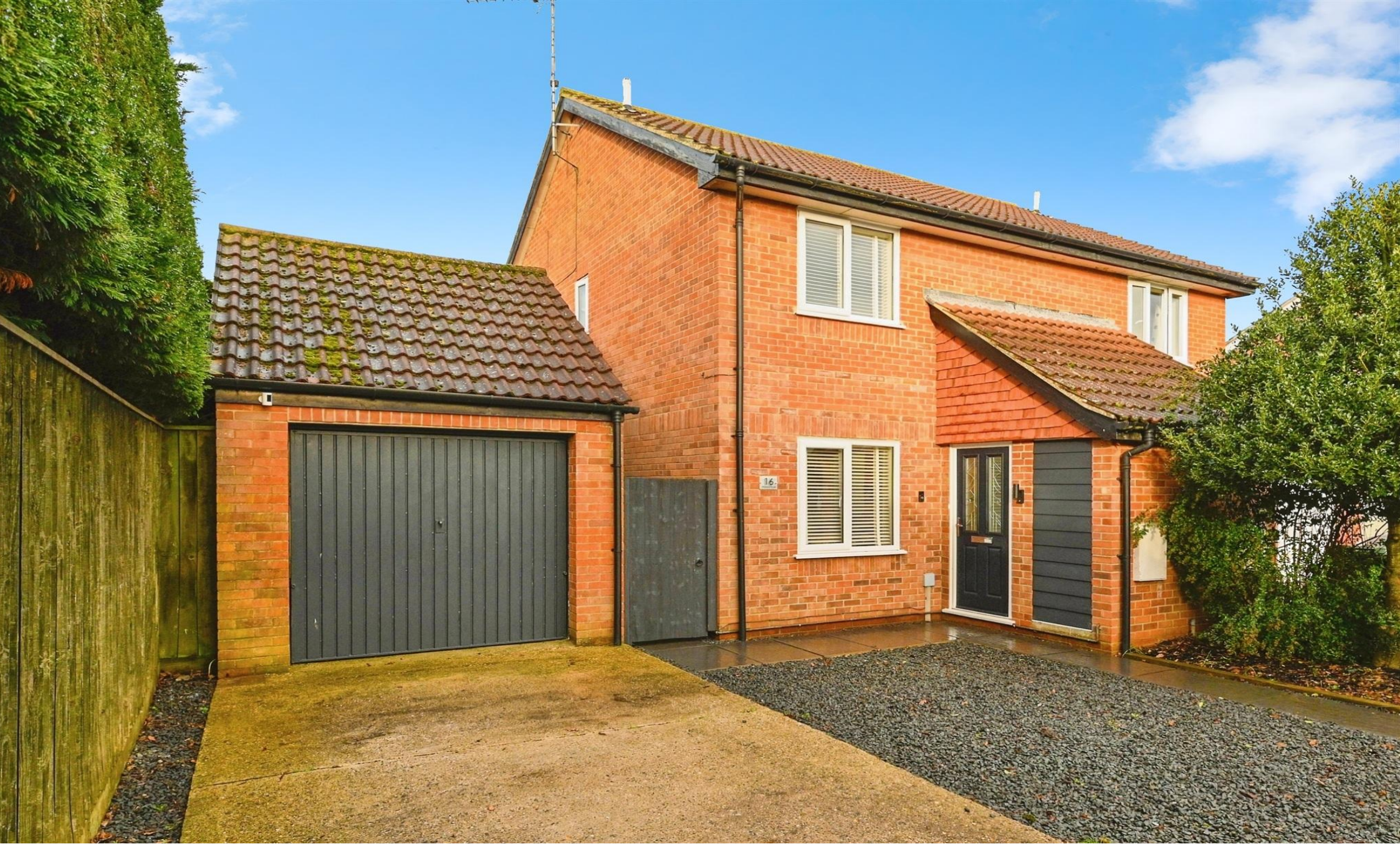
Wesley Road, North Wootton, King's Lynn, PE30 3XB