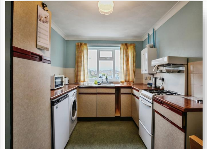
St. Annes Close, Skegness PE25 1DE