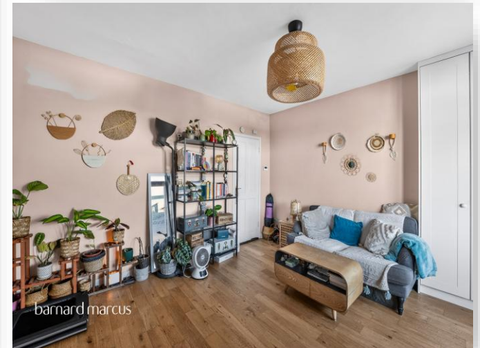
Chalmers House York Road, London SW11 3QT