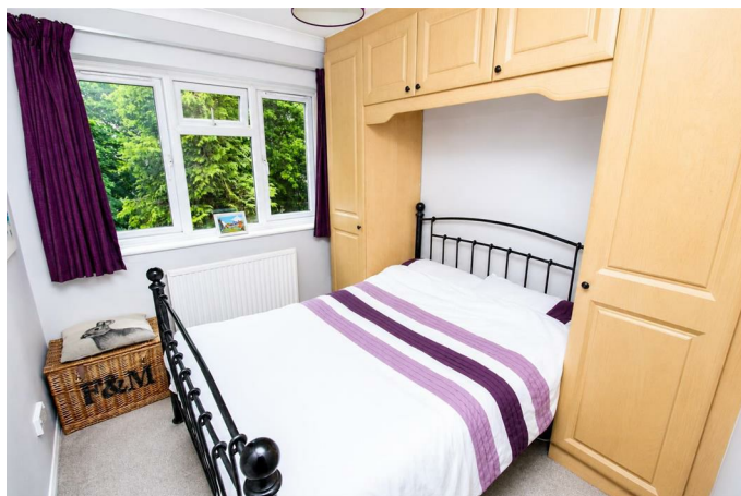
BEDROOM TWO 8'0 x 8'0 (2.44m x 2.44m)