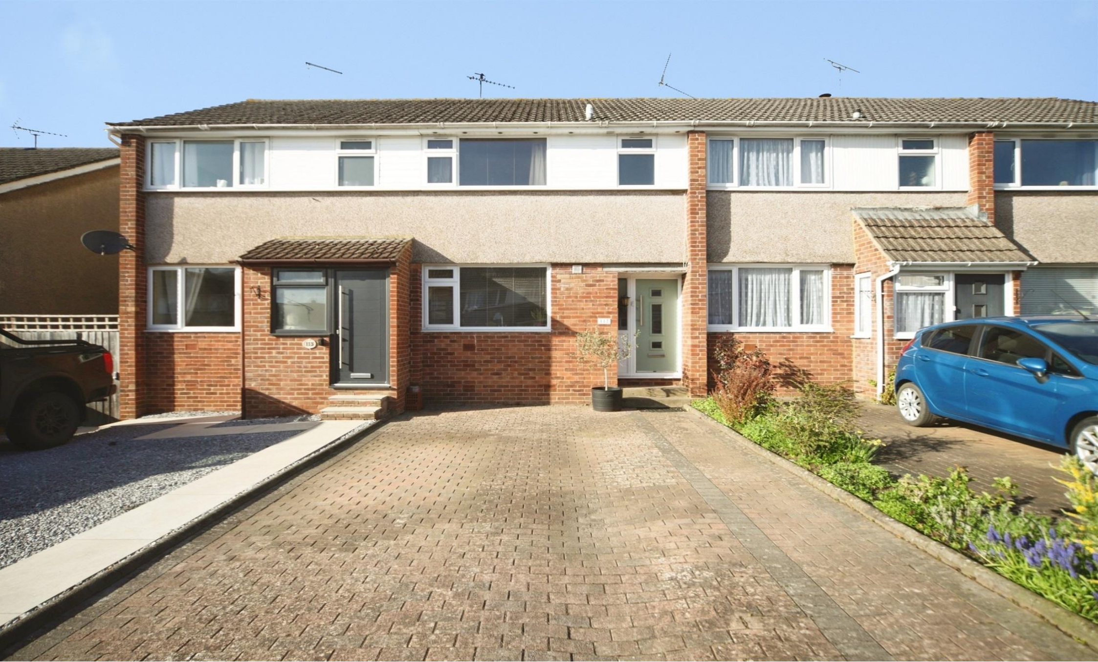
Farm View, TAUNTON TA2 7RD