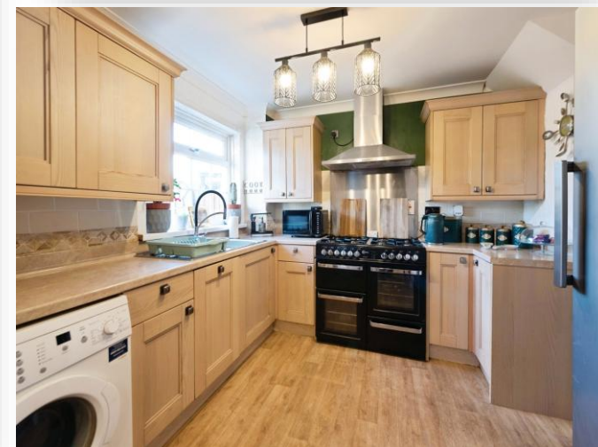
Dogwood Dell, Waterloooville PO7 8DB