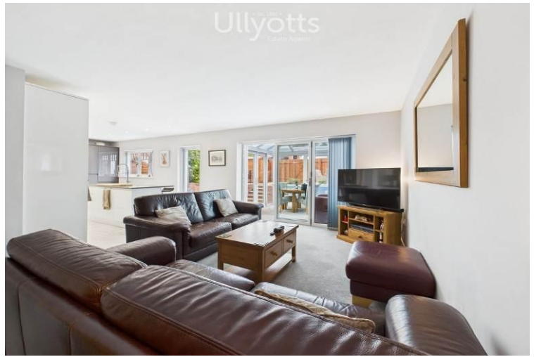
Lounge with Kitchen