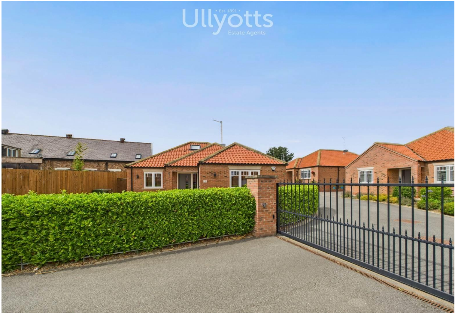
Remote controlled sliding gate