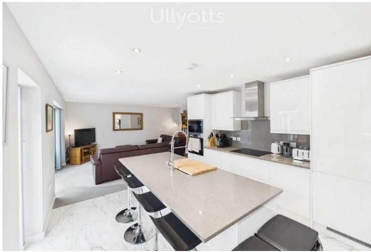
Lounge with Kitchen