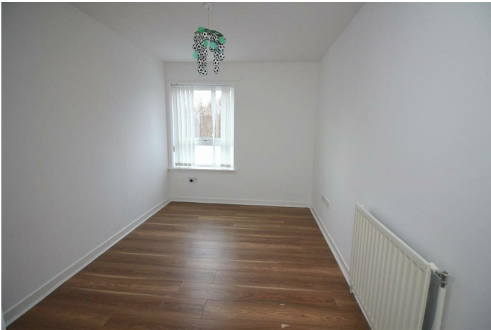
Bedroom 3 12'0" x 10'0" (3.66 x 3.07)