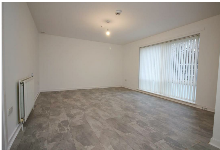
Dining Kitchen 15'4" x 10'10" (4.69 x 3.32)