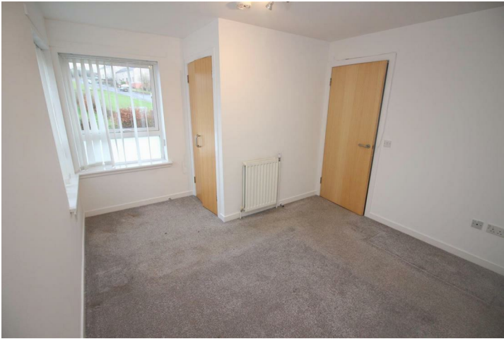
Bedroom 2 14'3" x 8'3" (4.35 x 2.54)