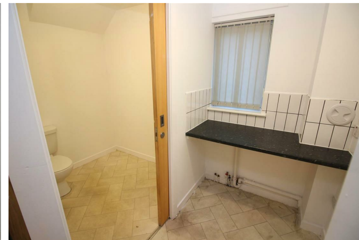
WC 5'10" x 5'9" (1.80 x 1.77)