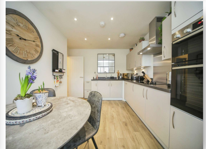
Cranesbill Way, Stowupland Stowmarket IP14 4FB