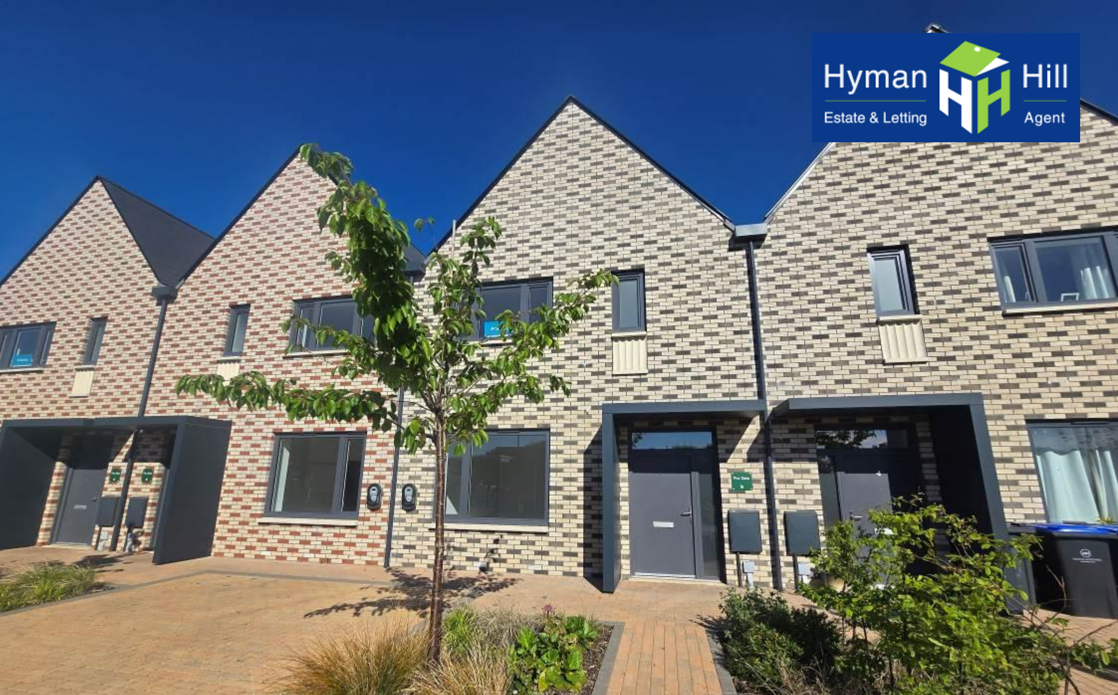
Plot 3, Pipit Mews, Southwick, West Sussex, BN42 4BZ