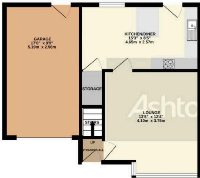
GROUND FLOOR 487 sq.ft. (45.3 sq.m.) approx.