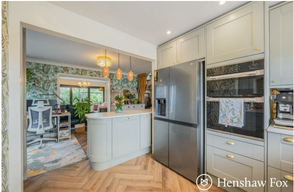
6 Shepherds Close | £475,000 Bartley, Southampton, SO40 2LJ