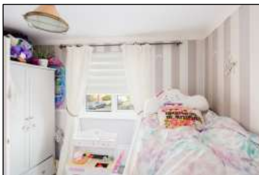
First Floor Bedroom Five