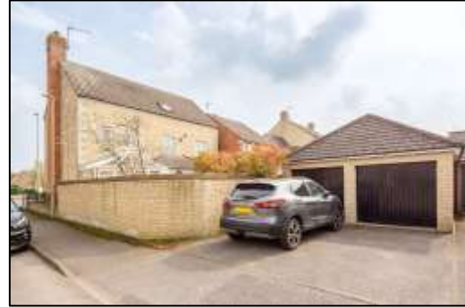
Garage and Parking