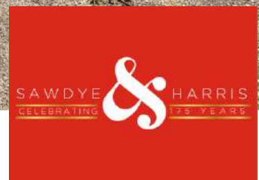
3 ROBOROUGH GARDENS, ASHBURTON