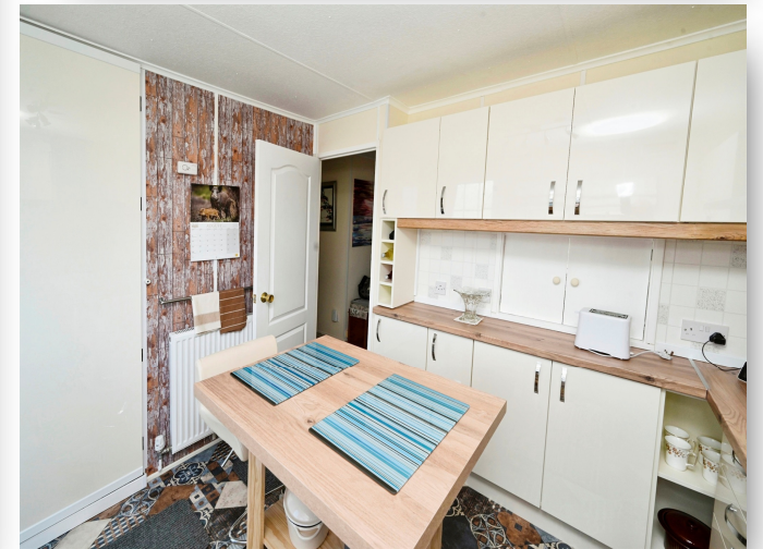
Kingfisher Drive Beacon Park Home Village, Skegness PE25 1TQ