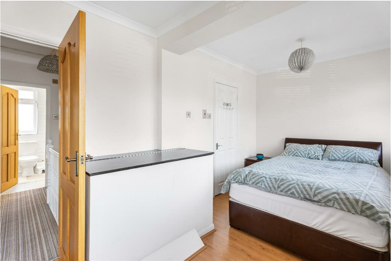
ENSUITE SHOWER ROOM Tiled flooring, glass shower cubicle, low flush WC, pedestal wash hand basin & chrome fixtures & fittings.