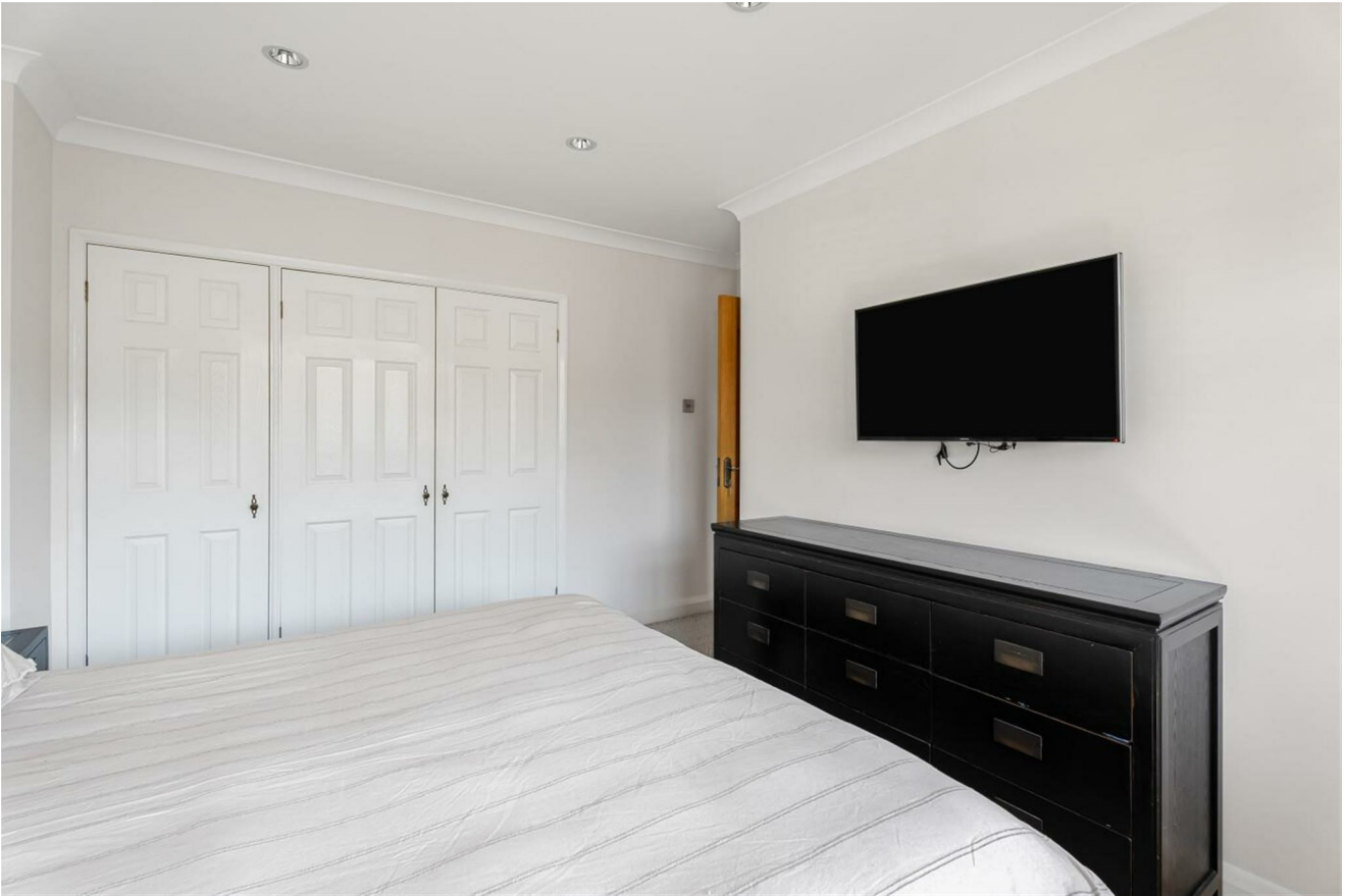
BEDROOM 2 16'10" x 8'6" (5.13m x 2.59m)

Two double glazed windows to the front, one with radiator beneath. Laminated flooring, fitted wardrobes. Pendant lighting & coving to the ceiling.