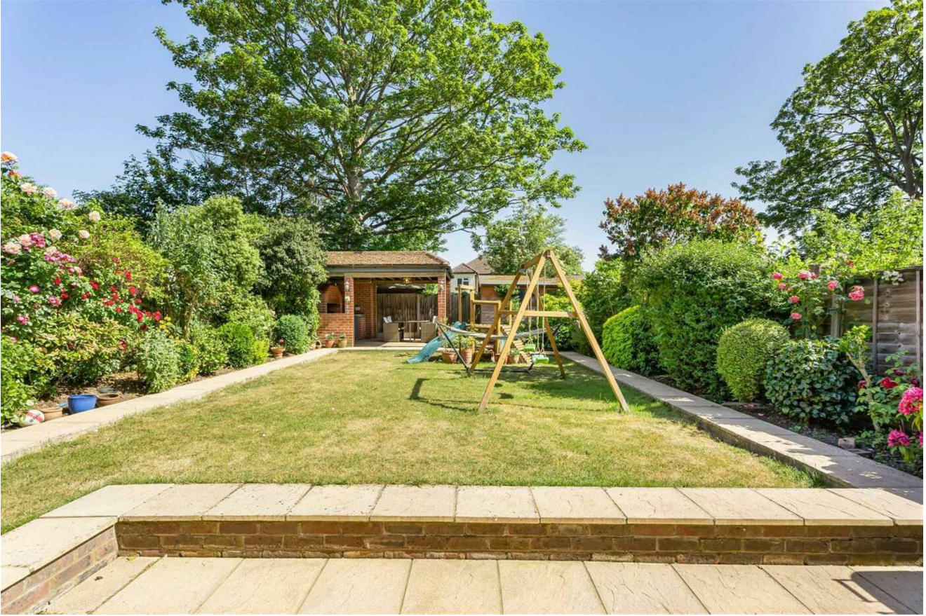
GARDEN (PIC 2)

South facing rear garden with a good sized patio area, mainly laid to lawn with beautifully kept mature flower beds. Brick built covered barbecue area & shed to the rear.