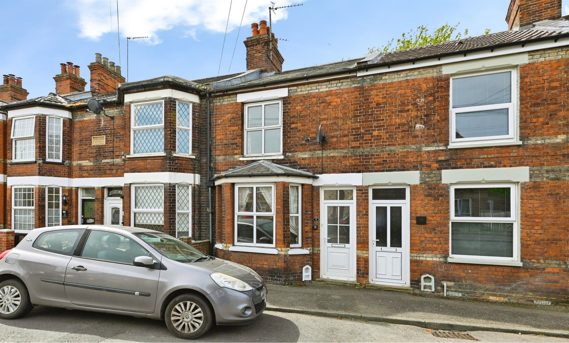
Eastgate Street, King's Lynn, PE30 1QX