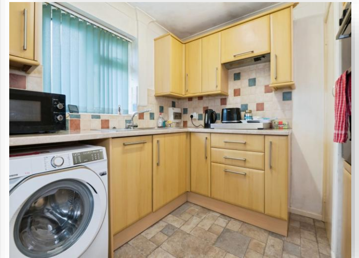
Itchenside Close, Southampton SO18 2LZ