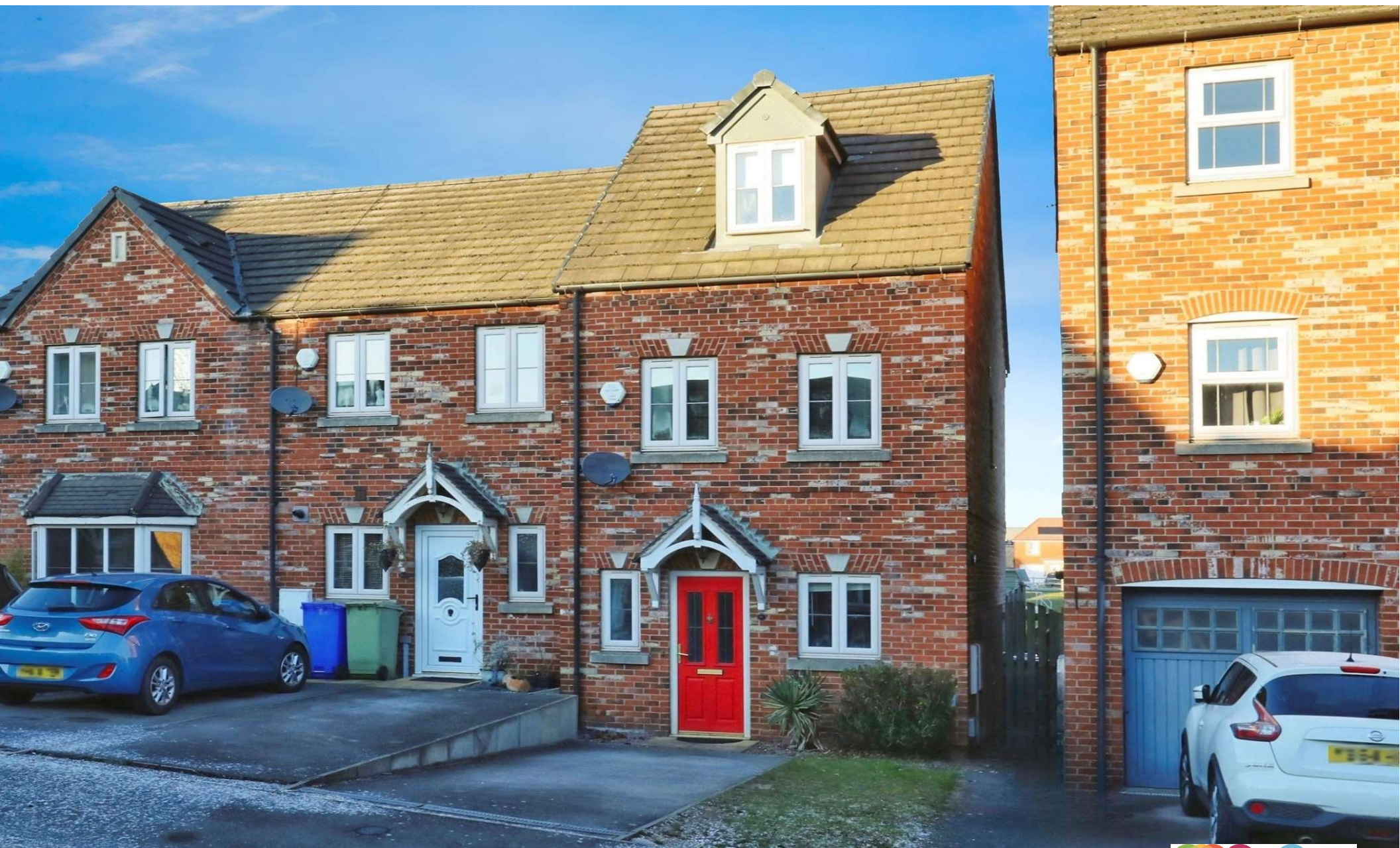
Sherwood Road, Harworth Doncaster DN11 8HX