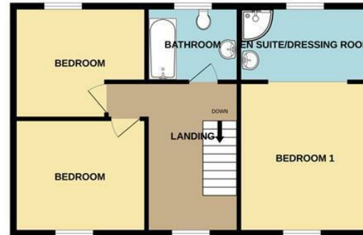
1ST FLOOR 626 sq.ft. (58.1 sq.m.) approx.