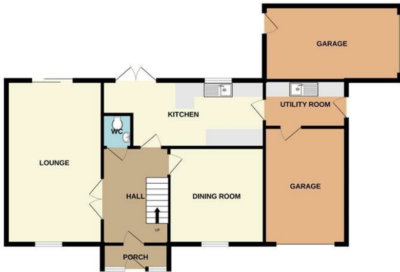
GROUND FLOOR 999 sq.ft. (92.8 sq.m.) approx.