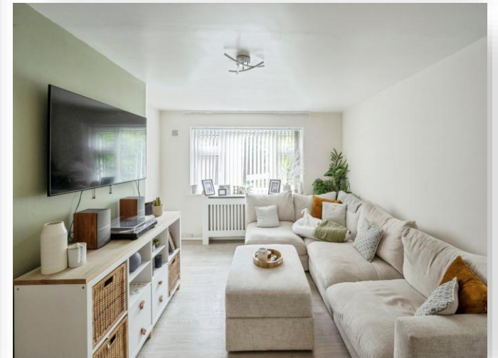
Shakespeare Road, Wath-Upon-Dearne Rotherham S63 6EA