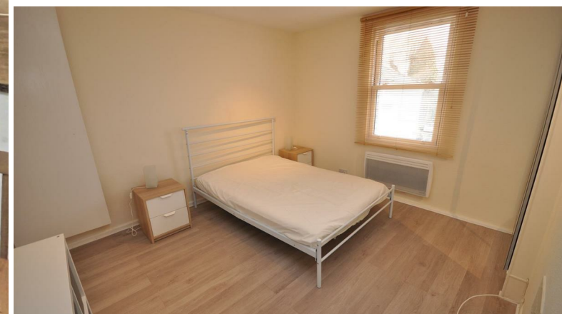
A one bedroom second floor apartment situated in this sought after location close to the town centre, with the benefit of communal courtyard garden.