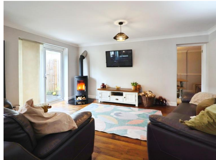
Palmers Drive, Cardiff CF5 5NR