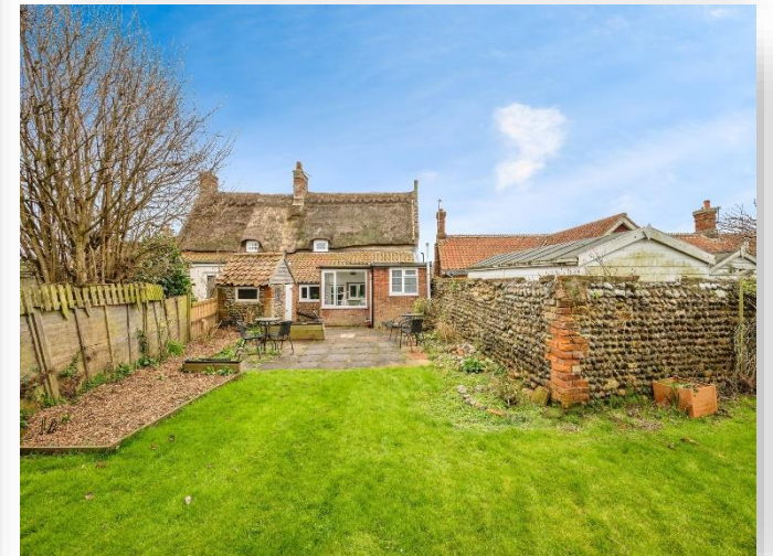
Keswick Cottages, Keswick Road, Bacton NR12 0HE