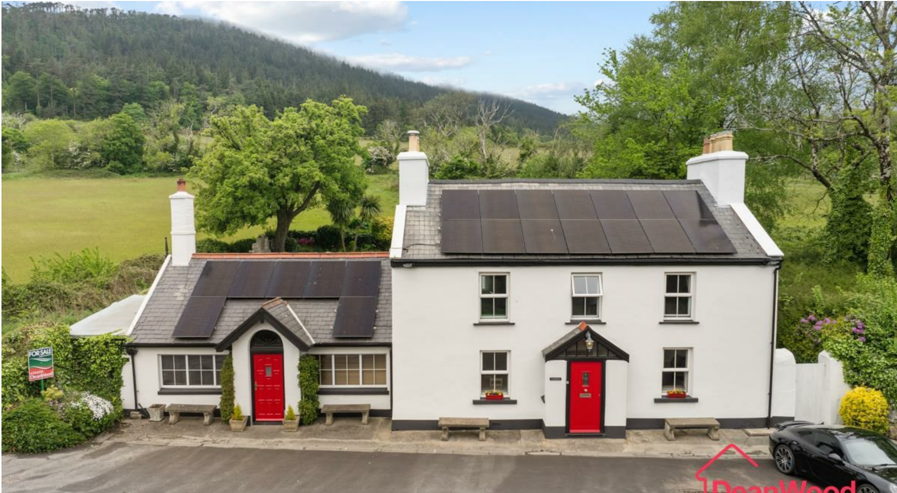
The Highlander Main Road, Crosby, Isle Of Man, IM4 2DP Asking Price £625,000